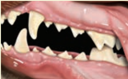
Healthy teeth and gums

It is not always easy to spot gum disease but taking a close look at the teeth and gums weekly is a good start