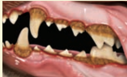
Early signs of gum disease