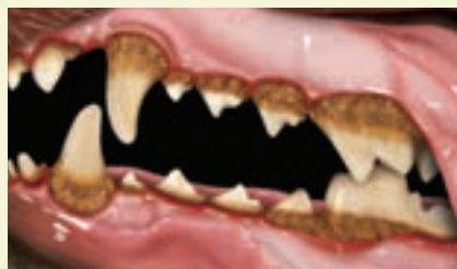
Early signs of gum disease