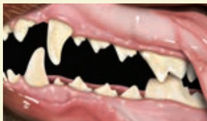
Healthy teeth and gums

It is not always easy to spot gum disease but taking a close look at the teeth and gums weekly is a good start